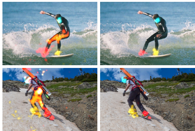
Figure 1. Illustration of the salient regions for regressing the keypoints. We take three keypoints, nose and two ankles, as an example for illustration clarity. Left: baseline. Right: our approach DEKR. It can be seen that our approach is able to focus on the keypoint regions. The salient regions are generated using the tool [46].

There are two main paradigms: top-down and bottom-up. The top-down paradigm first detects the person and then performs single-person pose estimation for each detected person. The bottom-up paradigm either directly regresses the keypoint positions belonging to the same person, or detects and groups the keypoints, such as affinity linking [7, 31], associative embedding [40], HGG [27] and HigherHRNet [11]. The top-down paradigm is more accurate but more costly due to an extra person detection process, and the bottom-up paradigm, the interest of this paper, is more efficient.