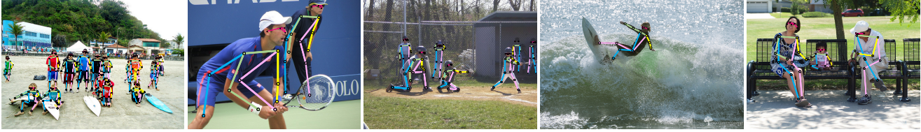
Figure 2. Multi-person pose estimation. The challenges include diverse person scales and orientations, various poses, etc. Example results are from our approach DEKR.

regression spread broadly and the regression quality is not satisfactory.