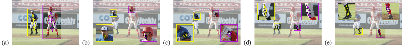
Figure 4. Illustrating adaptive activation. (a) Activated pixels from the single-branch regression. (b - e) Activated pixels for nose, left shoulder, left knee, and left ankle from the multi-branch regression (our approach) at the center pixel for each person. One can see that the proposed approach is able to activate the pixels around the keypoint. The illustrations are obtained using the backbone HRNet-W32.