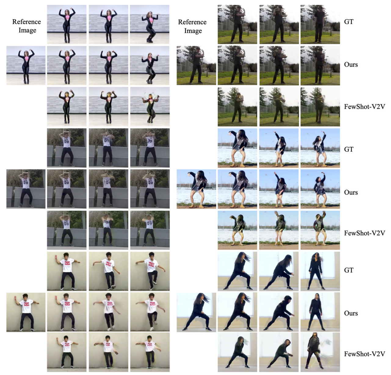
Figure 3. Qualitative results on the Youtube-Dancing dataset. The first and fifth column show one reference image from a target person. For each target person, we show short sequences, including the ground-truth driving images, and the images generated by our and FewShot-V2V [62] using the pose information from the driving images. As seen here, our approach clearly generates more realistic results.

analyze the effect of the number of reference images on the synthesis result using the iPER dataset. The experimental results, presented in Table 4, demonstrate that using more reference images improves the quality of the synthesized human bodies.