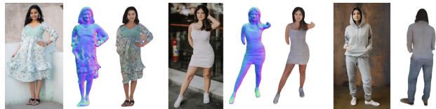
Figure 8. Failure cases. Wide clothing is under-represented in our dataset and this can be addressed with more diverse training. Complex poses can lead to missing body parts. The back-side sometimes mismatches the front (subject is wearing a hood).

Application Use Cases and Model Diversity. The construction of our model is motivated by the breadth of transformative, immersive 3D applications, that would become possible, including clothing virtual apparel try-on, immer-