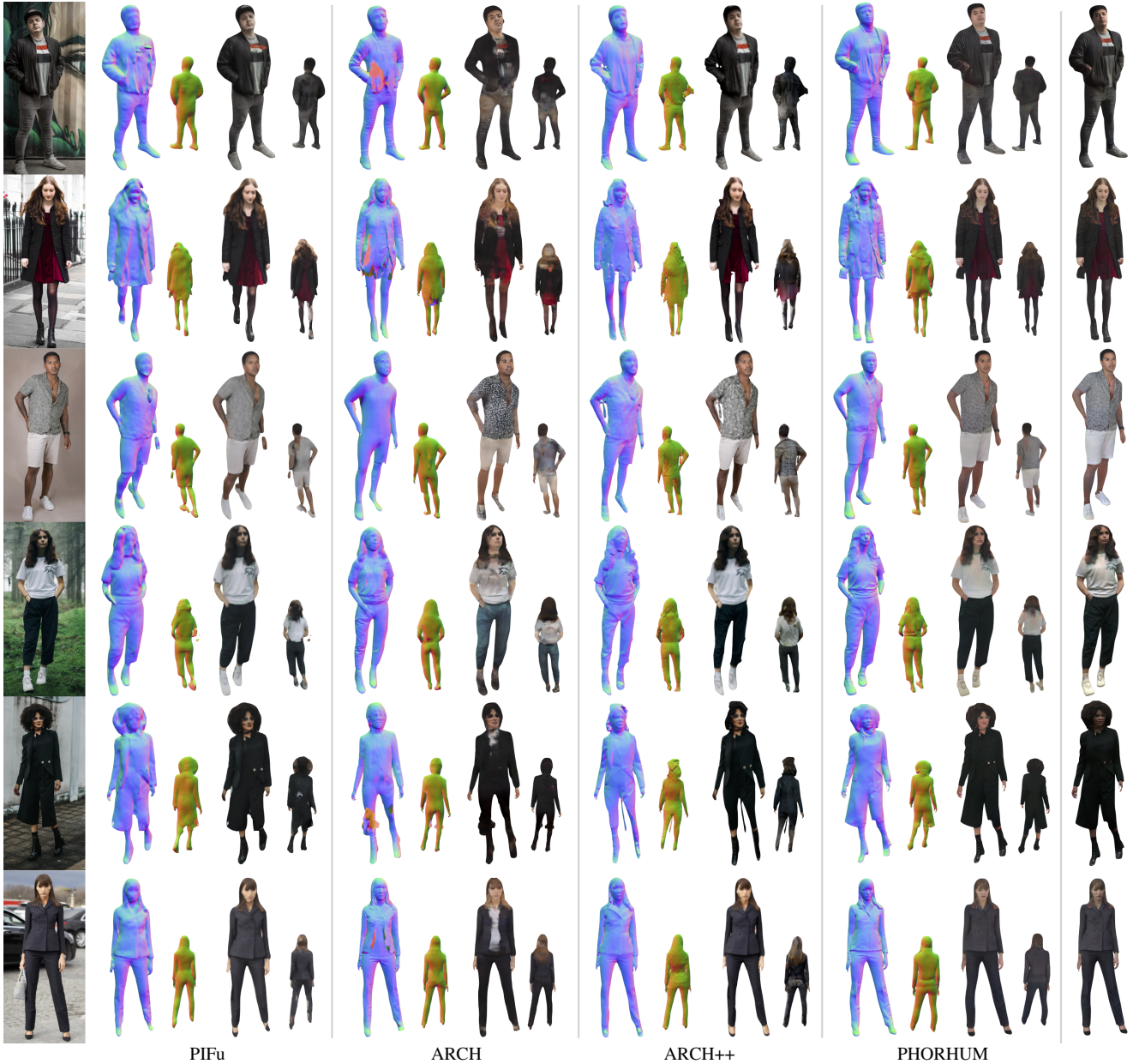
Figure 4. Qualitative comparisons on real images with state-of-the-art methods that produce color. From left to right: Input image, PIFu, ARCH, ARCH++, PHORHUM (ours), our shaded reconstruction. For each method we show the 3D geometry and the reconstructed color. Our method produces by far the highest level of detail and the most realistic color estimate for the unseen back side.

feature map, the feature extractor network does not learn to understand structural scene semantics. Here our patch-based rendering losses help, as they provide gradients for neighboring pixels. Moreover, our rendering losses could better connect the zero-level-set of the signed distance function with the color field, as they supervise the color at the current zero-level-set and not at the expected surface location. We plan to structurally investigate these observations, and leave these for future work.