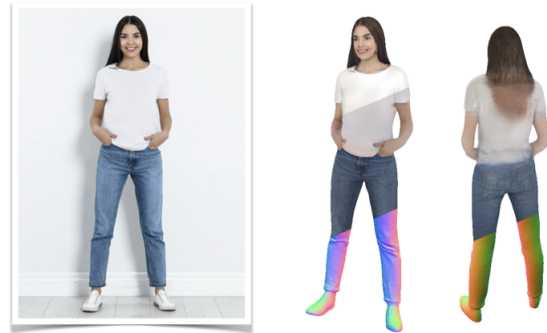
Figure 1. Given a single image, we reconstruct the full 3D geometry – including self-occluded (or unseen) regions – of the photographed person, together with albedo and shaded surface color. Our end-to-end trainable pipeline requires no image matting and reconstructs all outputs in a single step.

Prior to us, many researchers have focused on the problem of human digitization from a single image [5, 15, 16, 18,