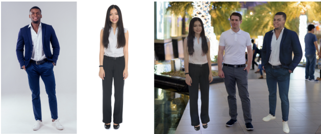
Figure 7. We can apply the estimated illumination from one image to another, which allows us to create the group picture (right) by inserting the reconstructions of the subjects (left) with matching shaded surface.

tion, see fig. 8. Loose, oversized, and non-Western clothing items are not well covered by our training set. The backside of the person sometimes does not semantically match the front side. A larger, more geographic and culturally diverse dataset would alleviate these problems, as our method does not make any assumptions about clothing style or pose.