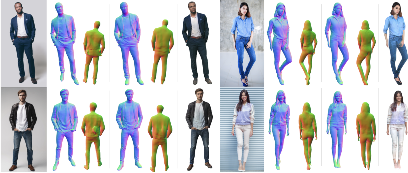
Figure 5. Qualitative comparisons on real images with the state-of-the-art method PIFuHD. We show front and back geometry produced by PIFuHD (left) and our results (right). Our reconstructions feature a similar level of detail but contain less noise and body poses are reconstructed more reliably. Additionally, our method is able to produce albedo and shaded surface color – we show our shaded reconstructions for reference.