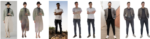
Figure 6. Loss ablation: The usage of our rendering losses (right) significantly improves albedo estimation. Note the unnatural color gradients when using sparse 3D supervision only (left).