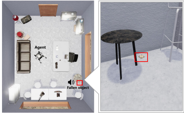
Figure 1. Illustration of the proposed embodied physical sound source localization: an agent hears a physical object fall somewhere in the same room, and is required to find it via asynchronous audio-visual integration.

Humans integrate multi-sensory data to understand the physical world around us. Consider the situation in which we hear the sound of an object falling somewhere in our house. What was it that fell, and where? Just by listening to the sound that is produced, we can usually determine not only the approximate location of the object that fell but also aspects of its physical make-up. The loudness of the sound, along with the reverberation that accompanies it, tells us much about the object’s size, force of impact, and distance [53]. And we can usually tell whether the object