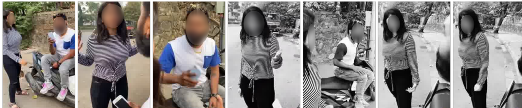
(d) Comedy Scene: A funny and sarcastic verbal exchange between two friends. Both display a range of emotions during the act but the overall outcome of the video is a comedic situation. Focussing on facial emotions or human pose might not be sufficient for understanding the scene.