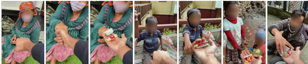
(c) Philanthropy Scene: A man meets and greets needy strangers and surprises them with a gift. In order to recognize this as a gesture of kindness, our model needs to understand the economical situation and emotional state of the subjects in the videos and focus on the exchange of tokens.