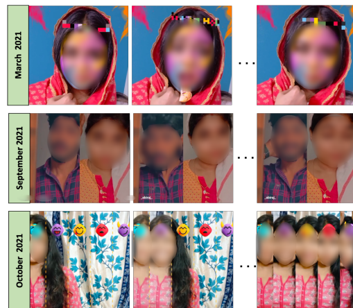
Figure 1. 3MASSIV : We highlight three videos uploaded by a particular user. The concept labels for these are festival , couple romance , comedy respectively. We also see the diversity in the video types, self-shot , split-screen and special effects . We also observe how the content is temporally aligned to real-world events; for instance, the festivals. 3MASSIV has 50K such annotated videos across 11 languages with masked user identifiers and timestamps for deeper semantic analysis of social media content. Faces have been blurred for preserving privacy.

Detecting these visual aspects helps in answering what occurs in a video? But, it does not capture how viewers interpret the video? and which concept(s) the creator of the video wishes to convey? In this work, we investigate the semantic understanding of videos uploaded on short-video social media platform - Moj 1 from the perspective of creators and viewers of these videos, which has not been explored before, primarily due to the lack of large-scale annotated video datasets. Considering the rapid adoption of social media, a holistic understanding of the creation, con-