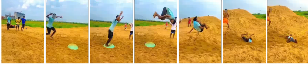
(b) Fail Scene: Kid is trying to perform a summersault using a small trampoline but fails to complete the flip. For correct classification, model needs to focus on the unplanned fall at the end of the video to classify it as a "fail" video.