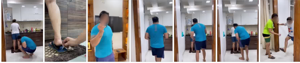
(a) Prank Scene: A man is trying to prank the lady by putting an adhesive on her footwear with the intent of creating a funny situation for the viewers. Deep semantic understanding is required to understand the spatio-temporal-audio context of the scene to classify as "prank" because detection of visual or audio aspects is not sufficient.