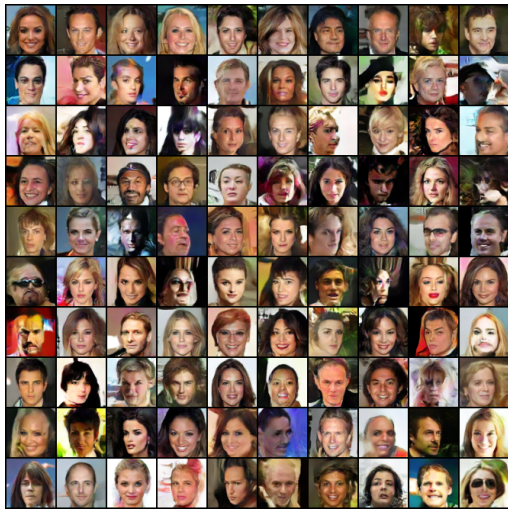
Figure 3. Randomly generated images on CelebA-64.