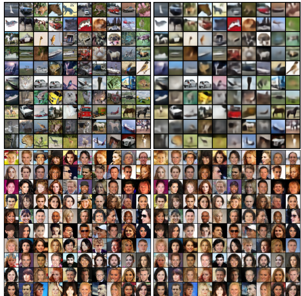
Figure 4. Test image reconstruction. Top: CIFAR-10. Bottom: CelebA-64. Left: test images. Right: reconstruction images.

The EBLVM defines an unnormalized density function which can be used for detecting OOD samples. Generative models like GANs are infeasible for OOD because the