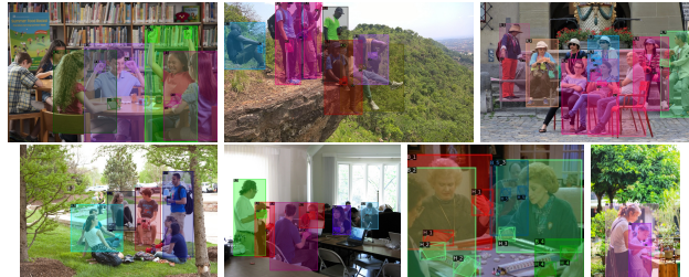
Figure 3. Representative images from the BodyHands dataset. Hands and bodies belonging to the same person have bounding boxes in the same color and identification numbers.

Annotation and Quality Control. We hired several annotation workers to annotate our dataset. For each person with