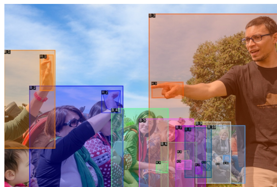
Figure 1. Hand Detection & Hand-Body Association. We develop a method to detect hands and their corresponding body locations. Hands and bodies belonging to the same person have bounding boxes in the same color and identification numbers.

Hand analysis is an important problem in Computer Vision with applications in human understanding, action, gesture, and sign-language recognition. The visual analysis of human hands is also vital for Augmented & Virtual Reality applications. Although the Computer Vision community has studied problems such as hand detection [7, 13, 23, 24, 30, 39, 49, 58, 59], hand pose estimation [17, 44, 51, 66, 67], hand tracking [48, 52, 53, 55, 63], and hand contact estimation [5, 33, 36, 47], there has been no significant effort in studying hand-body association.