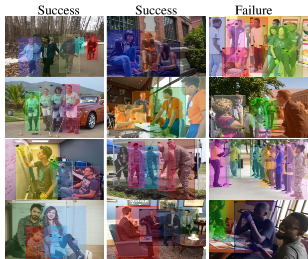
Figure 4. Qualitative results and failure cases. We visualize hands and bodies that belong to the same person using the same color and identification numbers.

MaskRCNN + X. We train MaskRCNN using a ResNet101 backbone to detect hands and bodies. We then use the Hungarian matching algorithm to match hands to bodies us-