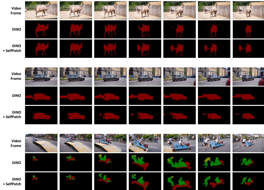
Figure 3. Visualization of video segmentation results on the DAVIS 2017 [24] benchmark. Top : input video frames. Middle and Bottom : segmentation results obtained by DINO and DINO + SelfPatch (ours), respectively. SelfPatch clearly improves the segmentation results, which is evidence that SelfPatch encourages the patch representations to learn semantic information of each object. Best viewed in color.

different types of neighbors: 3 \times 3 or 5 \times 5 patches around \mathbf{x}^{(i)} , or all patches (e.g., 14 \times 14 patches in the input resolution of 224 \times 224 ) in the given image \mathbf{x} . As shown in the (b) group in Tab. 4, considering patches far from \mathbf{x}^{(i)} is not helpful for selecting positives \mathcal{P}^{(i)} ; in particular, considering all patches shows even worse performance than the baseline (i.e., 55.1 \rightarrow 47.3 ) on the video segmentation task. This validates that restricting positive candidates as neighboring patches is a more reasonable way to find more reliable positive patches than considering far patches.