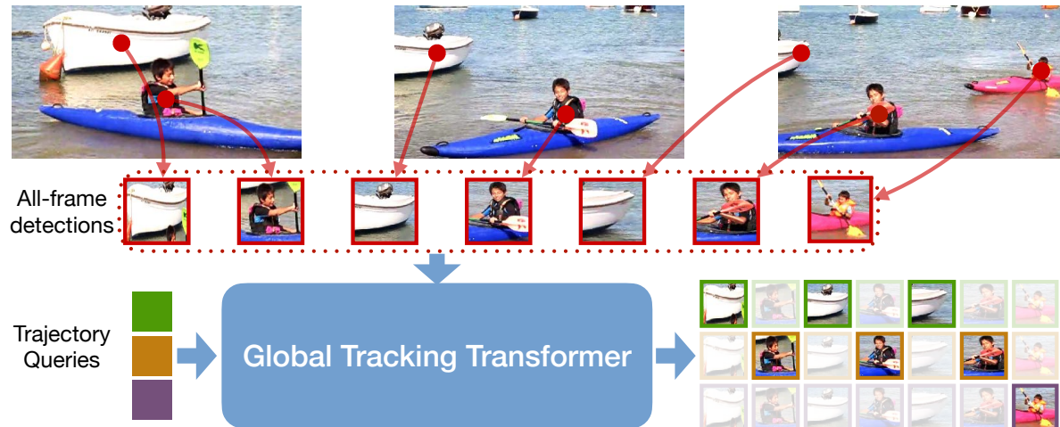
Figure 2. Overview of our joint detection and tracking framework. An object detector first independently detects objects in all frames. Object features are concatenated and fed into the encoder of our global Tracking transformer (GTR). The GTR additionally takes trajectory queries as decoder input, and produces association scores between each query and object. The association matrix links objects for each query. During testing, the trajectory queries are object features in the last frame. The structure of the transformer is shown in Figure 3.

using ground-truth trajectories and their image-level bounding boxes. During inference, we run GTR in a sliding window manner with a moderate temporal size of 32 frames, and link trajectories between windows online. The model is end-to-end differentiable within the temporal window.