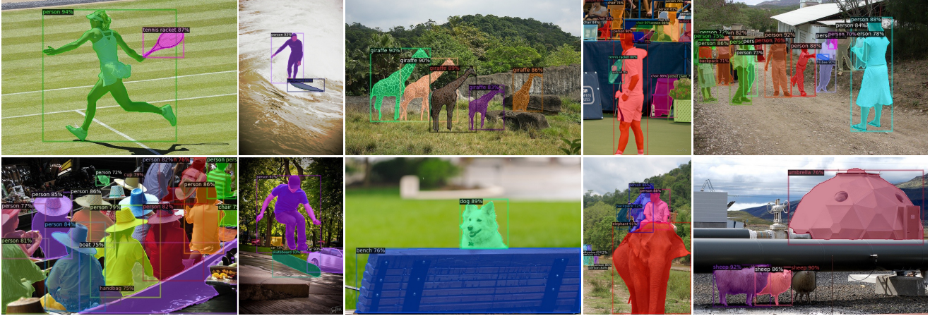
Figure 3. Visualization Results. We provide the visualization results of BoxTeacher with ResNet-101 on the COCO test-dev. The proposed BoxTeacher can produce the high-quality segmentation results, even in some complicated scenes.