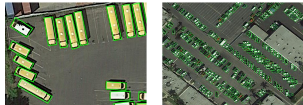
(a) Arbitrary rotating objects

Sufficient labeled data is essential for fully-supervised object detection. However, the data labeling process is time-consuming and expensive. Recently, Semi-Supervised Object Detection (SSOD), where object detectors are learned from labeled data as well as easy-to-obtain unlabeled data, has attracted increasing attention. Existing SSOD methods [16, 24, 44, 50] mainly focus on detecting objects with horizontal bounding boxes in general scenes. Nevertheless, in more complex scenes, such as aerial scenes, objects usu-