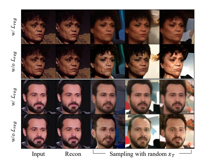
Figure 7. Ablation of using regularization loss for training. Regularization loss helps the model to contain identity and motion information in z_{\text{face}} as much as possible.

We further conduct an ablation study on our proposed regularization loss \mathcal{L}_{\text{reg}} . First, we train the model with the same setting but ablating \mathcal{L}_{\text{reg}} . As shown in Fig. 7, neither model has a problem with reconstruction. However, without the regularization loss, the identity changes significantly according to the random noise. Thus we can conclude that the regularization loss helps the model to decompose features effectively.