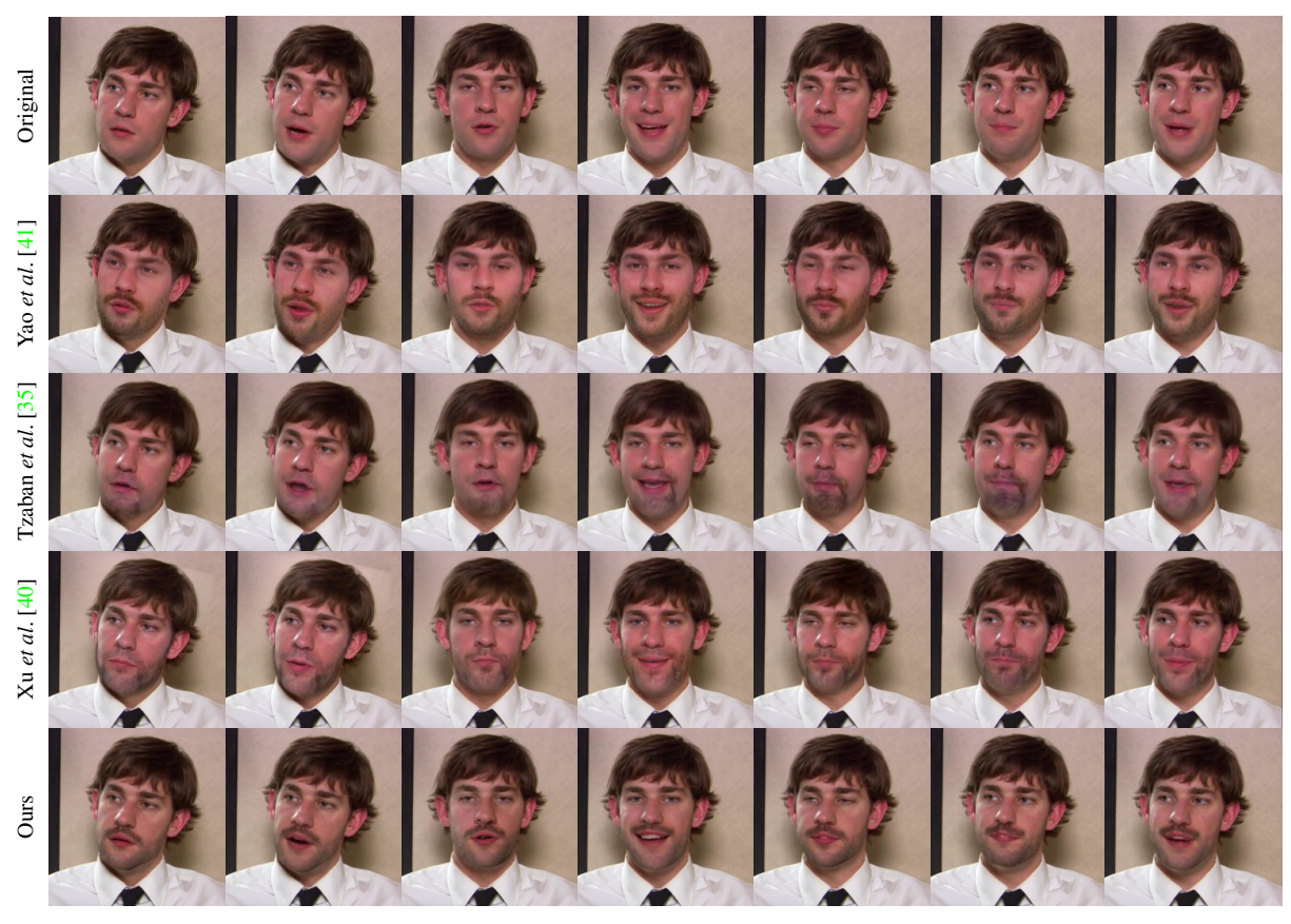
Figure 4. Comparison of temporal consistency to the previous video editing methods for 'beard'.

reverse process with (z_{\mathtt{face}}^{(n),\mathtt{edit}},x_T^{(n)}) where z_{\mathtt{face}}^{(n),\mathtt{edit}}=MLP(z_{\mathtt{id},\mathtt{rep}}^{\mathtt{edit}},z_{\mathtt{lnd}}^{(n)}) . Afterward, as with all previous work, the face part of the edited frame is pasted to the corresponding area of the original frame to create a clean final result. For this process, we segment face regions using a pretrained segmentation network [42]. Below, we explore two editing methods for our video editing framework.