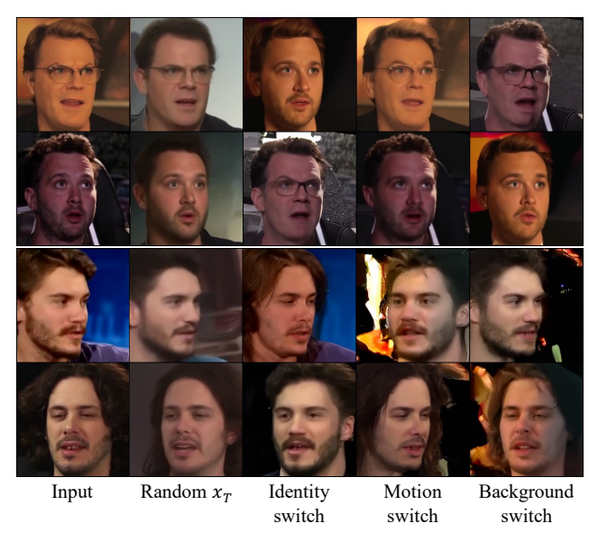
Figure 6. Demonstration of the disentangled video encoding.