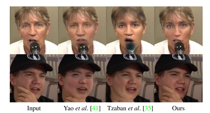
Figure 5. Editing wild face videos that GAN-based prior works struggled with. Classifier-based editing is used to make the person "young" (up) or change a "gender" (below).

For video editing, the ability to reconstruct the original video from the encoded one must be preceded. Otherwise, we will lose the original one before we even edit the video. To compare this ability with baselines quantitatively, we measure frequently used metrics for reconstruction -SSIM [37], Multi-scaled (MS) SSIM [38], LPIPS [43], and MSE - on randomly selected 20 videos in the test set of VoxCeleb1. As baselines, we compared our model with the GAN-based inversion method e4e [34] and PTI [27] used by Yao et al. [41] and Tzaban et al. [35], respectively. Since StyleGAN-based methods handle the higher resolution images with the size of 1024^2 , we resize the reconstructed results to 2562 for comparison. For our method, we vary the number of diffusion steps T to observe computational cost and image quality trade-offs. In Tab. 1, our diffusion video autoencoder with T=100 shows the best reconstruction ability and still outperforms e4e with only T=20.