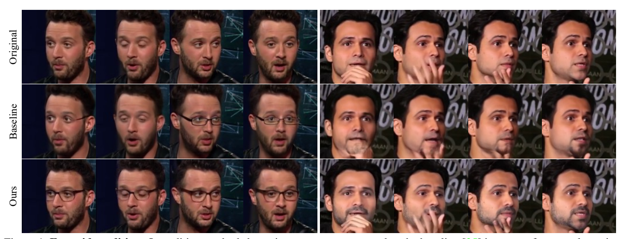
Figure 1. Face video editing. Our editing method shows improvement compared to the baseline [35] in terms of temporal consistency (left, "eyeglasses") and robustness to the unusual case such as the hand-occluded face (right, "beard").

{gmkim, shimazing, eunhoy}@kaist.ac.kr {hyunsu1125.kim, yunjey.choi, jhkim.ai}@navercorp.com