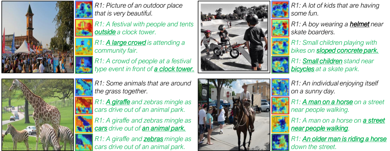
Figure 4. For each element of the image embedding set, we present its attention map and the caption nearest to the element in the embedding space. Matching captions are colored in green. Entities corresponding to the attention maps are underlined.

previous work, our method is evaluated under three different visual extractors: ResNet-152 [22] pretrained on ImageNet [11], ROI features [1] pre-extracted by Faster R-CNN [42], and ResNeXt-101 [51] pretrained on the Instagram [36] dataset. For ResNet-152 and ResNeXt-101, input image resolution is set to respectively 224 \times 224 and 512 \times 512 , following previous work [27, 45]. For the textual feature extractor, we use either bi-GRU or BERT. The ensemble results are obtained by averaging the similarity scores of two models trained with different random seeds.