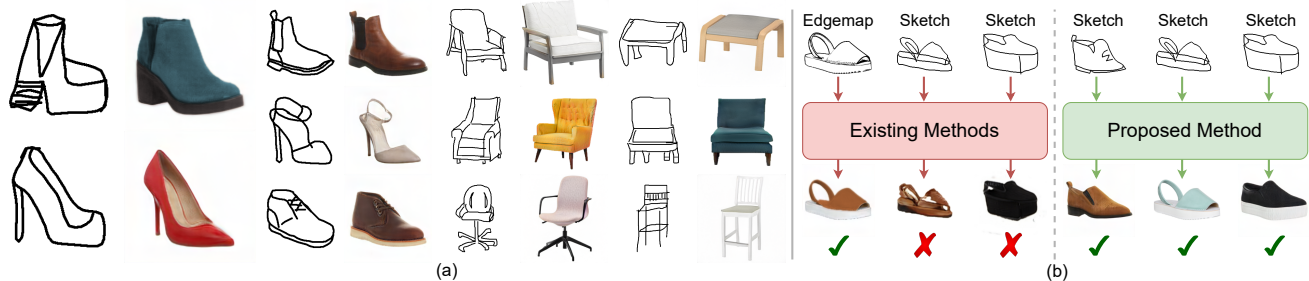
Figure 1. (a) Set of photos generated by the proposed method. (b) While existing methods can generate faithful photos from perfectly pixel-aligned edgemaps , they fall short drastically in case of highly deformed and sparse free-hand sketches . In contrast, our autoregressive sketch-to-photo generation model produces highly photorealistic outputs from highly abstract sketches .

{s.koley, a.bhunias, a.sain, p.chowdhury, t.xiang, y.song}@surrey.ac.uk