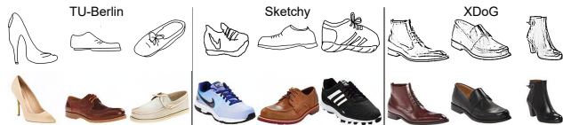
Figure 5. Generalisation across unseen sketch styles.

Generalisation onto Unseen Dataset: Fig. 5 shows a few shoe sketches randomly sampled from Sketchy [76] and TU-Berlin [24] datasets, and a few XDoG [87] edgemaps. While the edgemaps are perfectly pixel-aligned, sketches show significant shape deformation and abstraction. However, our model trained on ShoeV2 generalises well to all unseen sketch styles, yielding compelling results.