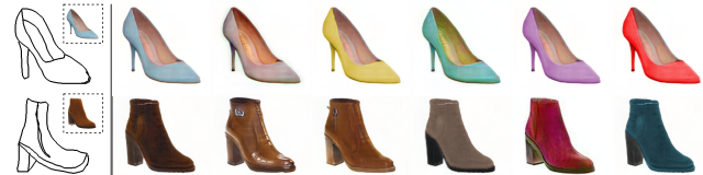
Figure 8. Multi-modal generation showing varied colour (top), appearance features (bottom). Reference photo shown in inset.

Fine-grained Control: The proposed method also allows multi-modal generation with fine-grained appearance control by replacing [69] medium or fine-level latent codes with random vectors (Fig. 8). Furthermore, Fig. 9 shows results with increasing number of unrolling (Sec. 5.1) steps, where detail gets added progressively with every increasing step.