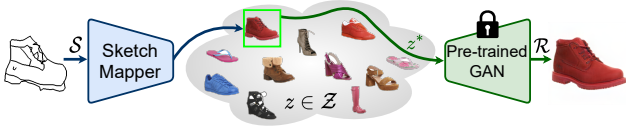
Figure 2. The sketch mapper aims to predict the corresponding latent code of associated photo in the manifold of pre-trained GAN.

Advantages of decoupling the encoder-decoder training are twofold – (i) the GAN model [46, 47] pre-trained on real photos is bound to generate realistic photos devoid of unwanted deformation, (ii) while output quality and diversity of coupled encoder-decoder models were limited by the training sketch-photo pairs [41], our decoupled decoder being independent of such pairs, can model the large variation of a particular dataset using unlabelled photos [46, 47] only. Sketch-photo pairs are used to train the sketch mapper only.