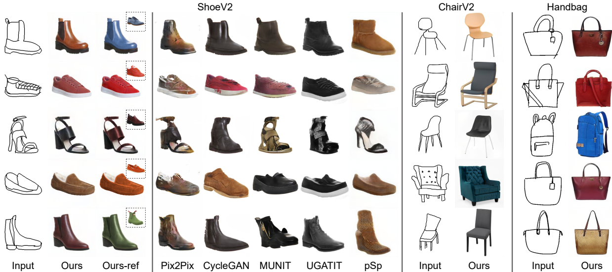
Figure 4. Qualitative comparison with various state-of-the-art competitors on ShoeV2 dataset. Ours-ref (column 3) results depict that our method can faithfully replicate the appearance of a given reference photo (shown in the top-right inset).