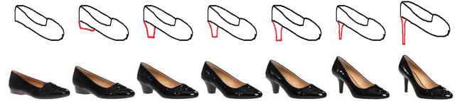
Figure 7. Sketches of an editing episode (edited strokes in red) and corresponding output photos.

Precise Semantic Editing: Local semantic image editing is a popular application of GAN inversion [4]. Our method enables realistic semantic editing, where modifying one region of an input sketch, yields seamless local alterations in the generated images. Fig. 7 depicts one such sketch editing episode where the user gradually changes the heel length via sketch, to observe consistent local changes in the output photo domain. To our best knowledge, this is one of the first attempts towards such fine-grained semantic editing.