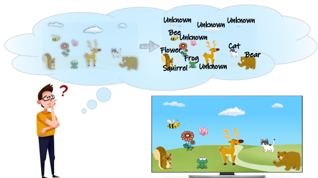
Figure 1. When faced with new scenes in open world, humans subconsciously focus on all foreground objects and then identify them in detail in order to alleviate the confusion between the known and unknown objects and get a clear view. Motivated by this, our CAT utilizes the shared decoder to decouple the localization and identification process in the cascade decoding way, where the former decoding process is used for localization and the latter for identification.

cial intelligence (AI) smarter to face more difficulties in real scenes. Within the OWOD paradigm, the model's life-span is pushed by iterative learning process. At each episode, the model trained only by known objects needs to detect known objects while simultaneously localizing unknown objects and identifying them into the unknown class. Human annotators then label a few of these tagged unknown classes of interest gradually. The model given these newly-added annotations will continue to incrementally update its knowledge without retraining from scratch.