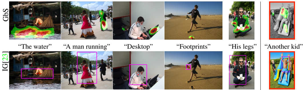
Figure 3. (Top) GbS heatmaps; (Bottom) IG [23] predicted boxes; (Middle text) grounding queries. We show cases where GbS handles phrases which are less familiar or ambiguous to the detector. On the right, where the query is ambiguous, both methods failed.