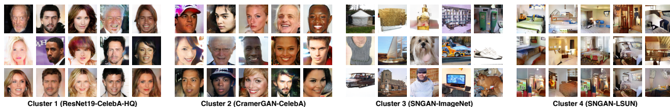
Figure 3. Samples from clusters discovered by our approach for unseen GANs with the majority class in parenthesis. It can be noticed that they are not just focusing on the object structure and semantics rather the underlying source.