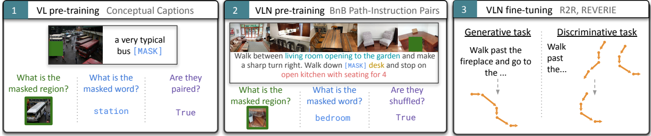
Figure 3: Overview of our pretraining approach. Instead of the usual VL pretraining (panel 1), we adopt in-domain data and use the path-instruction pairs to train Airbert with the masking and shuffling losses (panel 2). We fine-tune Airbert on downstream VLN tasks using both discriminative or generative models (panel 3).

ing loss: An input image region or word is randomly replaced by a [MASK] token. The output feature of this masked token is trained to predict the region label or the word given its multi-modal context. (2) Pairing loss: Given the output features of [IMG] and [CLS] tokens, a binary classifier is trained to predict whether the image (path) and caption (instruction) are paired.