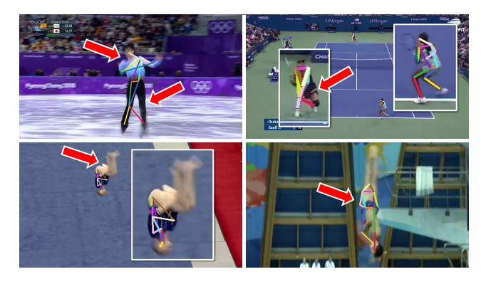
Figure 1: Limitations of current 2D pose detectors. Stateof-the-art pose estimators [45] produce noisy and incorrect results in frames with challenging motions, common in sports video. Here are examples from figure skating, tennis, gymnastics, and diving where pose estimates are incorrect.

State-of-the-art skeleton-based deep learning techniques for action recognition [31, 57] rely on accurate 2D pose detection to extract the athletes' motion, but the best pose detectors [45, 54] routinely fail on fast-paced sports video with complex blur and occlusions, often in frames crucial to the action (Figure 1). To circumvent these issues, end-to-end learned models operate directly on the video stream [7, 13, 28, 43, 51, 62]. However, because they consume pixel instead of pose inputs, when trained with few labels, they tend to latch onto specific visual patterns [9, 52]