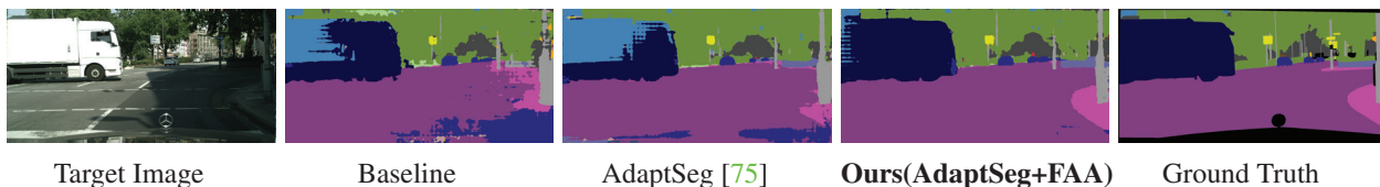
Figure 3. Qualitative illustration of domain adaptive semantic segmentation task GTA5 to Cityscapes task. Our robust domain adaptation (RDA) employs Fourier adversarial attacking to mitigate the overfitting in domain adaptive learning effectively, which produces better semantic segmentation by mitigating over-fitting in domain adaptive learning. The differences are clearer for less-frequent categories such as traffic-sign, pole and bus, etc.