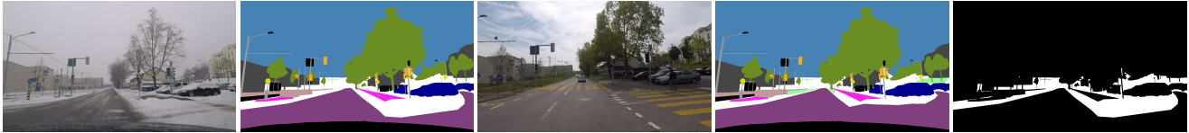
(a) Input image I (b) Stage 1 annotation (draft) (c) Corresponding image I' (d) Stage 2 annotation (GT) (e) Invalid mask J