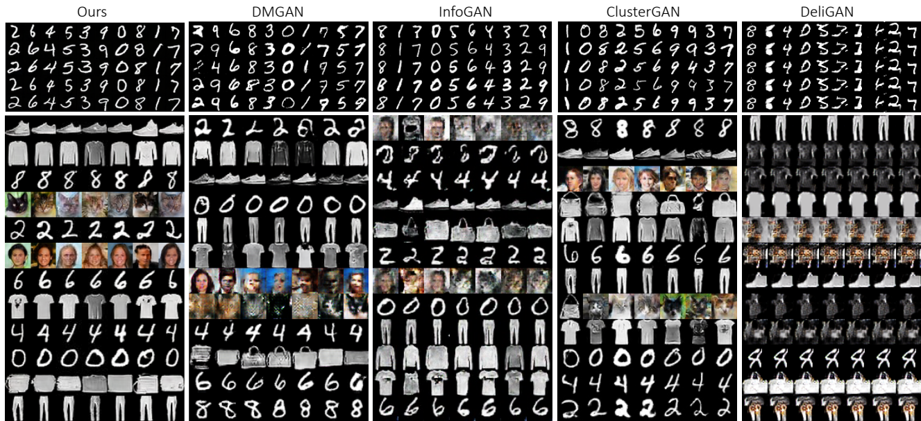
Figure 3. Generation comparisons on MNIST (top) and Hybrid (bottom) dataset. We use the ground-truth K = 10 on MNIST and K = 12 on Hybrid for InfoGAN, ClusterGAN and DeliGAN, and K = 25 for MNIST and K = 25 for Hybrid for MIC-GANs and DMGAN. Each column is generated from a mode for MNIST (top), and each row is generated from a mode for Hybrid (bottom).