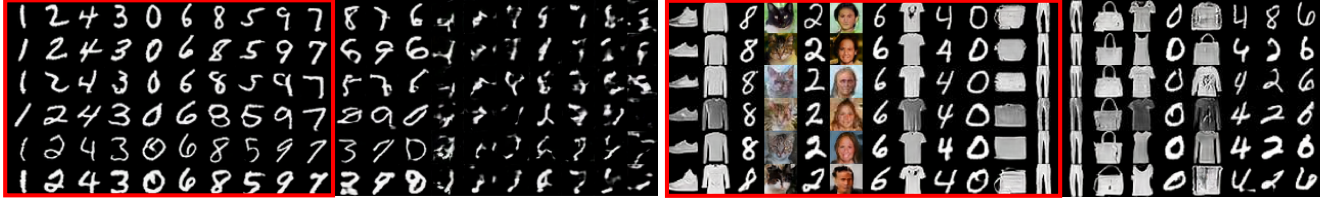
Figure 1. Our results on MNIST (left) and Hybrid (right) dataset, both with K = 25 . Each column is generated from a mode, and the columns are sorted by \alpha_s (the last 4 modes are not shown). The red boxes mark the top n modes in the results.