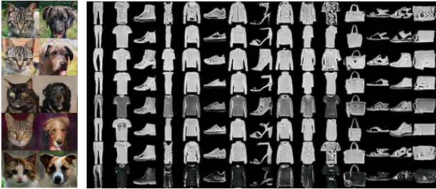
Figure 2. Our results on CatDog (left) and FashionMNIST (right) dataset. Each column is generated from one mode, and the columns are sorted by \alpha_s .