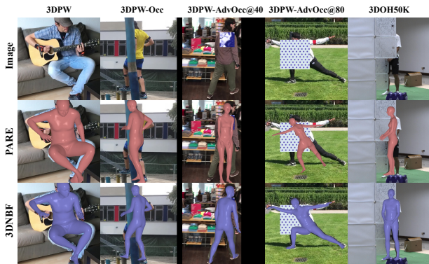
Figure 3: Qualitative results on evaluated datasets.