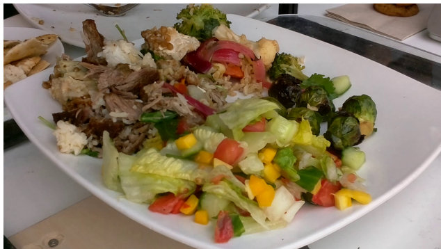
Figure 1. A single frame from one Nutrition5k dish, with fine-grained ingredient annotations (Table 1).