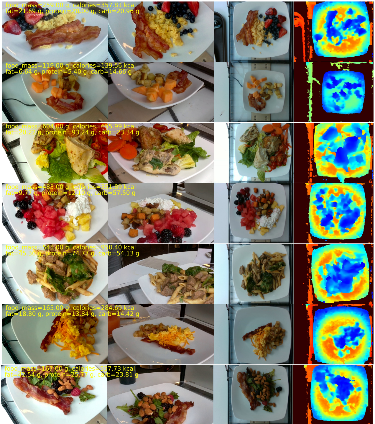
Figure 2. Some examples from the proposed Nutrition5k dataset. Each row represents data associated with a single dish (of the roughly 5000 dishes). The first and second images are frames taken from the 30° and 60° videos, respectively. These frames represent only a single view that the rotating cameras see during their 360° capture of the plate. The third and fourth images are taken from the overhead Intel RealSense depth camera (depth is presented in RGB for better visualization). We also show some of the ground truth annotations associated with each dish.