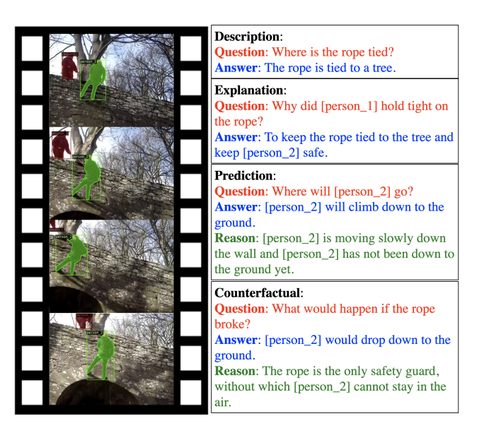
Figure 1. Sample video, questions, and answers from our Causal-VidQA dataset. Causal-VidQA is designed to evaluate whether models can understand what is in the video (description), explain the intentions of actions or procedures to certain targets (explanation), predict what will happen in the future (prediction), and imagine the scenarios in different conditions (counterfactual).

Videos, which are organized as a sequence of images along the temporal dimension, usually contain richer temporal and causal relations than simple images [2]. With advanced neural network, video understanding has achieved great progress in representation learning, such as video captioning [23], video action recognition [38], video relation grounding [45], video descriptive question-answering [48], and video instance segmentation [50]. Therefore, for a computational model, recognizing some independent actions or segmenting some specific instances in a video becomes relatively easy [12, 31, 57], however, performing the reasoning from video clips remains a great challenge. On the contrary, it is easy for human beings to answer reasoning questions