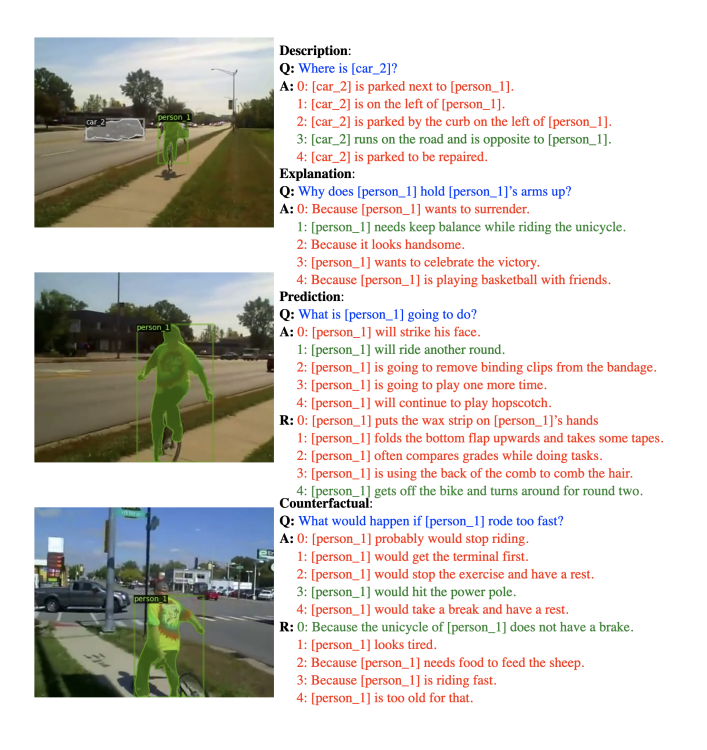
Figure 2. Example of multi-choice question-answering. The answers and reasons highlighted in bold are the correct answers and reasons. Best viewed by zooming in.

In this work, we target at real-world video understanding, without any restriction to scenes or actions. According to this goal, we review multiple different video datasets