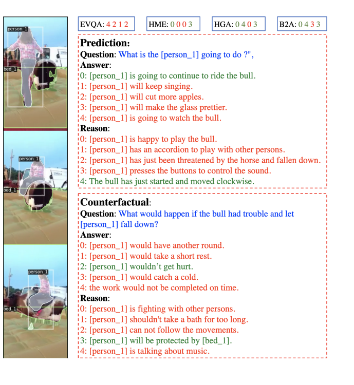
Figure 4. Qualitative examples of EVQA [1], HME [6], HGA [18], B2A [34] on predictive and counterfactual questions. Numbers in blue boxes indicates the choice of model for the prediction-answer, prediction-reason, counterfactual-answer, and counterfactual-reason, where the red ( resp. , green) number represents that the choice of the method is wrong ( resp. , right). Correct answers and reasons are highlighted in bold.