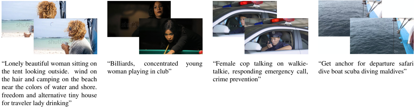
Figure 2: Example video-caption pairs from the WebVid2M dataset: Note the different captioning styles: from left to right, captions can be (i) long, slightly poetic, with disjoint sentences and phrases, (ii) succinct and to the point, (iii) have a less defined sentence structure with keywords appended to the end, (iv) mention specific places (‘maldives’). We show two randomly sampled frames for each video.

walkie-talkie” or “playing billiards” would be missed when looking at certain frames independently.