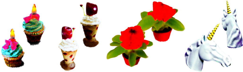
Figure 11: Examples from the modified version of the sketch shape pipeline of Latent-NeRF [?]