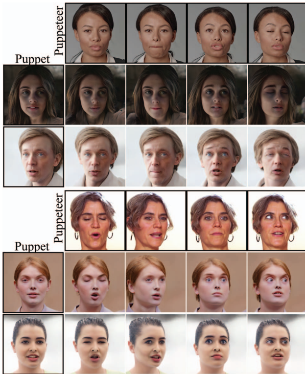
Figure 4. Qualitative evaluation of puppeteering , where the encoded parameters of the puppeteer are applied to the ID-latent of the puppet. It could be observed that even complex facial deformations are transferred well across different identities.

present in common low-resolution datasets. Each video contains a single face performing significant face deformations, head motion, and speech. Additional details of the dataset are included in Sec. F.1 in supplementary. There exists an inherent quality loss in the GAN inversion stage as the real-world subjects would mostly be out-of-domain of StyleGAN resulting in notable deviations between the e4e encoded frames and real frames. Thus, to improve the photo-realism of the initial GAN inversions while maintaining editability, PTI [23] was used. Kindly refer Sec. C of the supplementary.