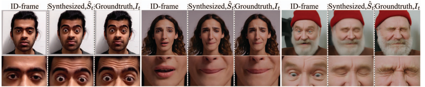
Figure 3. Qualitative examples yielded through our approach (in addition to Fig. 1). The StyleSpace indices and the optimization procedure were carefully designed such that complex and fine facial details such as lip-pressing, mouth puckering, mouth gaping, and wrinkles around the eyes, mouth, nasal-bridge, and forehead are well-captured.