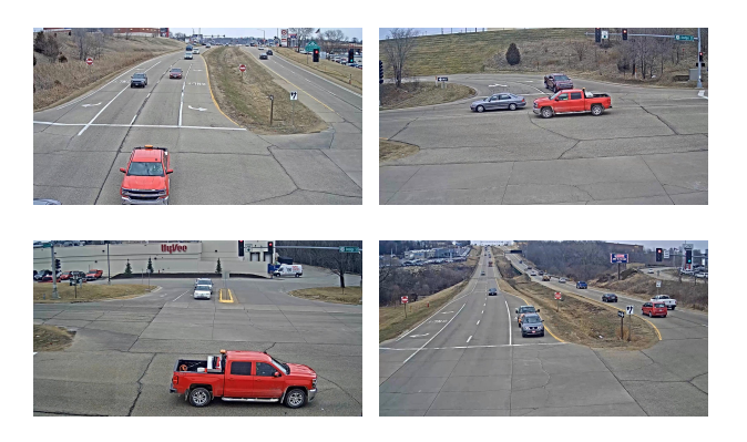
Figure 1: Images of different cameras. These images come from the same moment in the same scene, and the camera angle is changed.

Identifying vehicles in different scenes and angles remains challenging, and the reasons mainly exist in two aspects. First, in traffic scenarios, vehicle feature extraction is susceptible to illumination, camera viewpoints and occlusion. For example, the color of the images in the backlit camera will change, which is a severe problem for the human eye as well as the computer. Meanwhile, for feature extraction, it is difficult to handle vehicle images at different angles (front and rear). Second, it is difficult to achieve accurate re-identification results by only using image information. Typically, most large vehicle datasets contain a large number of vehicles of the same model and similar colors.