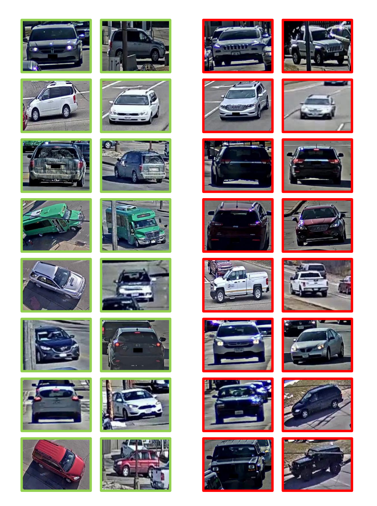
Figure 5: Visual examples of vehicle re-identification results. We show two columns of ranking result. The left column represents the eight pairs of correct samples, and the right column shows another eight pairs of vehicles with mistaken re-identified, thought both of vehicle in each pair have the similar appearance and meet the spatial-temporal constraint.