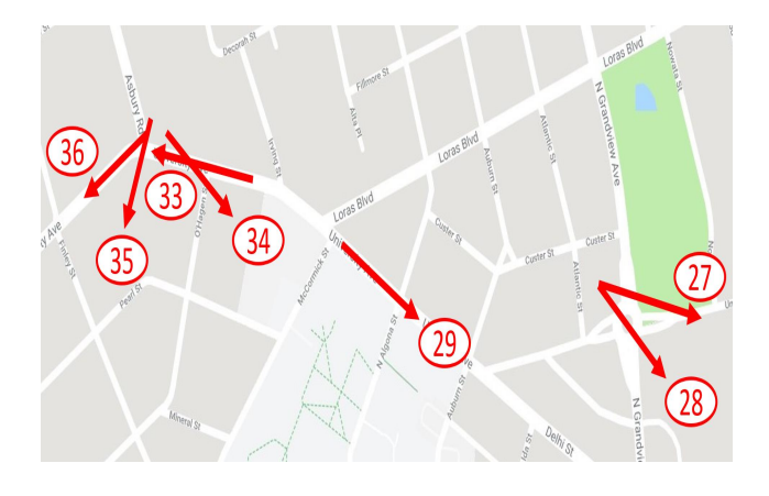
Figure 2: Some urban environment and camera distribution of the vehicle re-identification task. The red arrows denote the locations and directions of cameras. In this dataset, the original videos and calibration details are available. Thus, for each test image, there exists a location stamp and a time stamp.

identifying red vehicles with different poses in Fig. 1. To alleviate this problem, we propose to utilize location and time information to improve retrieval accuracy. To obtain the vehicle location and time stamps, we first use Mask-RCNN [9] to generate the detection bounding box. Then, we calculate the feature distances between the detected bounding boxes and test images. Thus, we can obtain the location and time details of test vehicles by associate camera information. Depending on the stamps of vehicles, we set several thresholds to control the number of gallery vehicles for each query. By setting the latest arrival time and earliest departure time, we can get an appropriately sized gallery set.