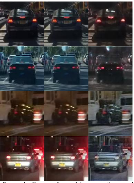
Figure 1. Semantically transformed images of cars with day or night attributes. The first column contains the original images. The second column and third column show images reconstructed by the AttGAN under the original and flipped attributes. The trained AttGAN successfully learns to decouple the 'day/night' attribute from the underlying invariant data. Note the varying appearance of taillights under the day and night attributes.

Training perception systems on such imbalanced data would result in undefined behaviour in rare, yet critical, environmental changes. Therefore, an approach to augment an existing dataset with environmental transformations is necessary. Existing approaches to this problem rely on the use of 3D simulations [4, 16] to generate synthetic data. However, these approaches are often not realistic and perception models trained on these augmentation methods are susceptible to synthetic artifacts. On the other hand, a well-trained