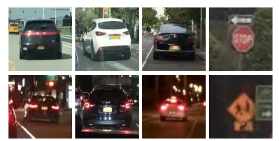
Figure 3. Examples of images from the BDD++ dataset. The first row contains image crops generated with the daytime label. The second row correspondingly shows images generated with the night attribute. The samples show two objects of interest generated by the trained attribute encoder: cars and traffic signs.