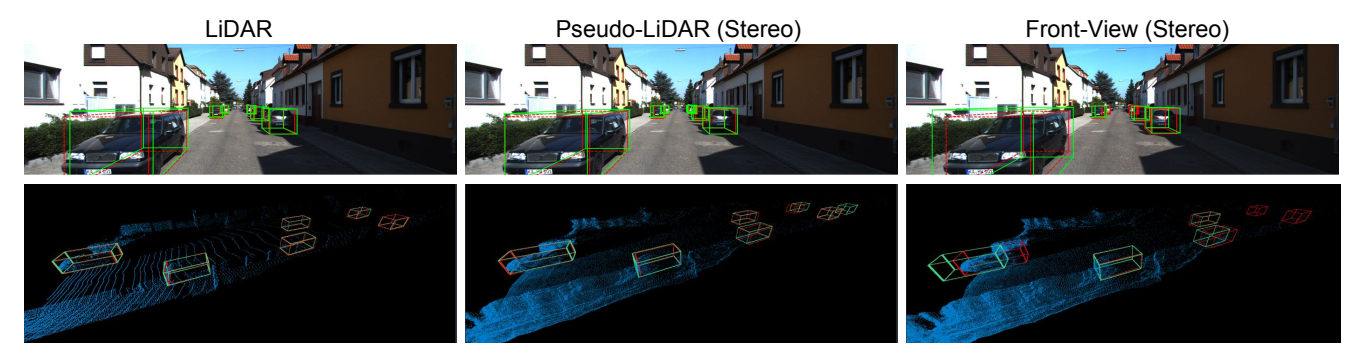
Figure 4: Qualitative comparison. We compare AVOD with LiDAR, pseudo-LiDAR, and frontal-view (stereo). Ground-truth boxes are in red, predicted boxes in green; the observer in the pseudo-LiDAR plots (bottom row) is on the very left side looking to the right. The frontal-view approach ( right ) even miscalculates the depths of nearby objects and misses far-away objects entirely. Best viewed in color.

pseudo-LiDAR (middle), and frontal stereo (right). We used PSMNET★ to obtain the stereo depth maps. LiDAR and pseudo-LiDAR lead to highly accurate predictions, especially for the nearby objects. However, pseudo-LiDAR fails to detect far-away objects precisely due to inaccurate depth estimates. On the other hand, the frontal-view-based approach makes extremely inaccurate predictions, even for nearby objects. This corroborates the quantitative results we observed in Table 2. We provide additional qualitative results and failure cases in the Supplementary Material.