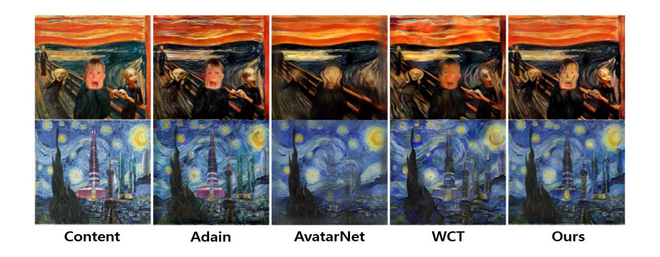
Figure 1: Comparisons of image harmonization.