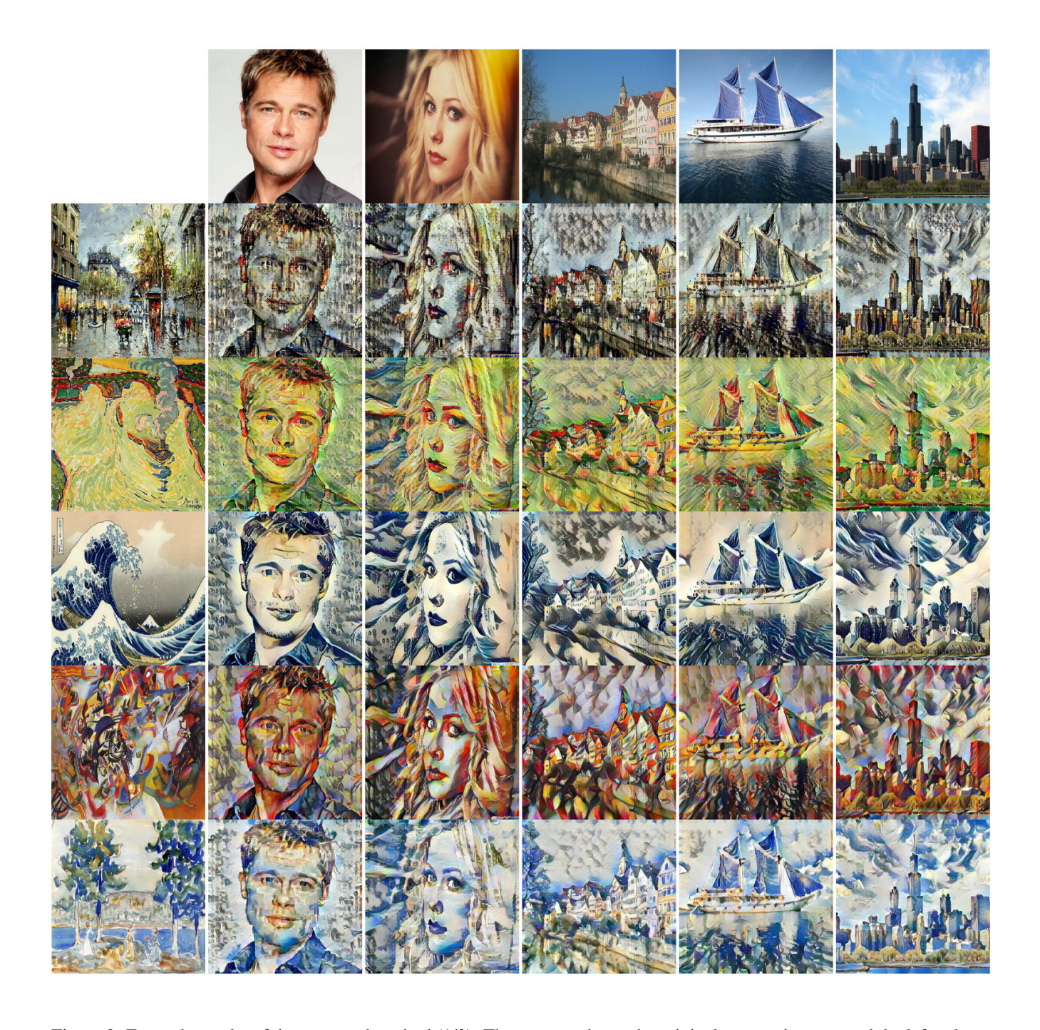
Figure 3: Example results of the proposed method (1/3). The top row shows the original content images, and the left column shows the original style images.