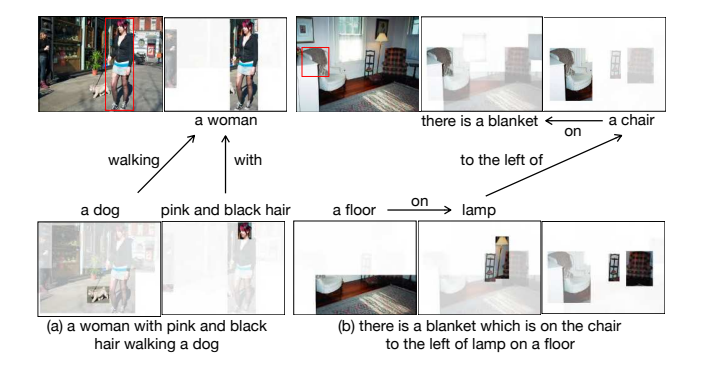
Figure 3. Qualitative results showing the attention maps over the objects along the language scene graphs predicted by the SGMN.

Visualizations of two examples along with their language scene graphs and attention maps over the objects in images at every node of the language scene graphs are shown in Figure 3. This qualitative evaluation results demonstrate that the proposed SGMN can generate interpretable visual evidences of intermediate steps in the reasoning process. In Figure 3(a), SGMN parses the expression into a tree structure and finds the referred "woman" who is walking "a dog" and meanwhile is with "pink and