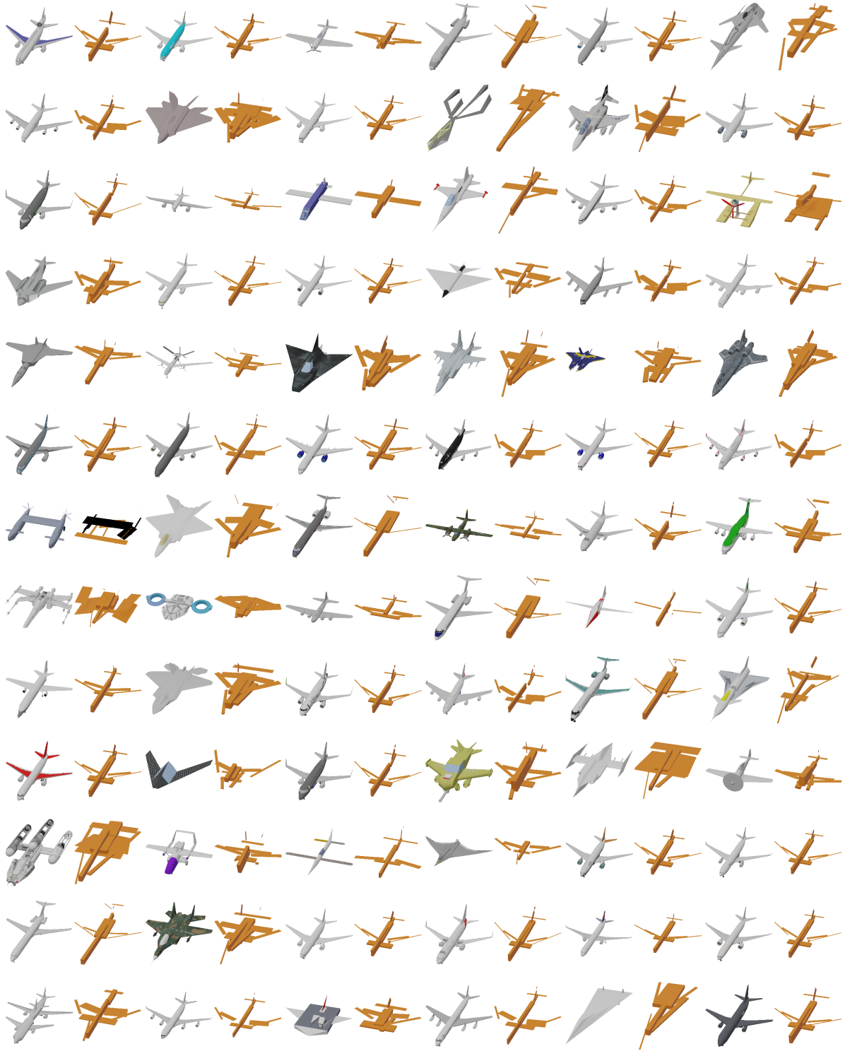
Figure 22: Cuboid abstractions of ShapeNet airplanes. We show our abstraction (orange) next to each input.