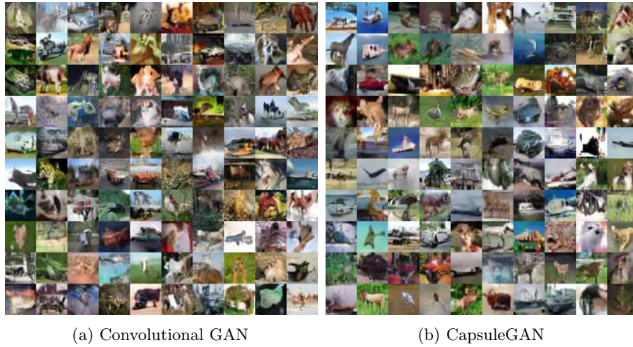
Fig. 2: Randomly generated CIFAR-10 images

Therefore, for CapsuleGAN to win against GAN, both r_{samples} < 1 and r_{test} \simeq 1 must be satisfied. In our experiments, we achieve r_{samples} = 0.79 and r_{test} = 1 on the MNIST dataset and r_{samples} = 1.0 and r_{test} = 0.72 on the CIFAR-10 dataset. Thus, on this metric, CapsuleGAN performs better than convolutional GAN on the MNIST dataset but the two models tie on the CIFAR-10 dataset.