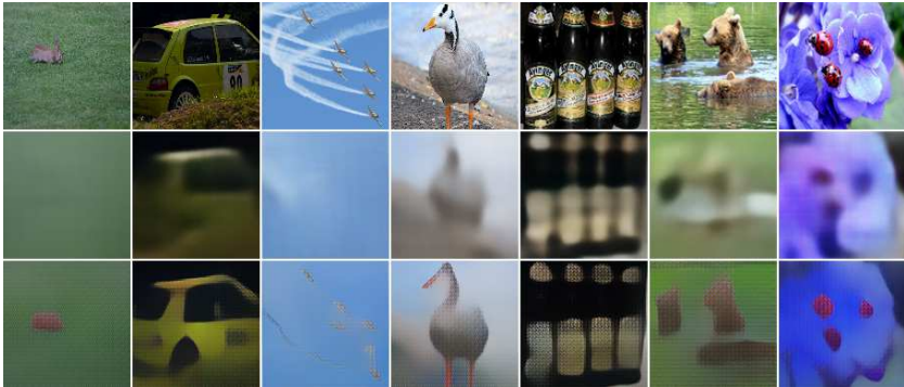
Fig. 2. Top: original images from the Salient Object Subitizing dataset [45]. Center: VAE reconstructions using traditional loss. Bottom: VAE reconstructions using feature perceptual loss. Note the improved ability to reconstruct salient objects and contour sharpness, likely beneficial for object subitizing.

We use this formulation with both encoder and decoder parametrized as convolutional neural network to learn visual representations from a large collection of images displaying scenes with a varying number of salient objects.