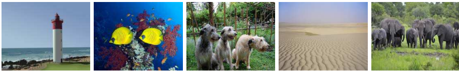
Fig. 1. Example images from the Salient Object Subitizing dataset [45]. Although the ability to subitize should allow people to identify the number of instances in each image at a glance, these scenes pose a challenge to computer vision models due to variety in appearance, saliency ambiguity, scene clutter and occlusion.

do not capture the complexity of natural visual scenes. In this work, we focus on unsupervised learning of numerosity representations from natural images containing diverse object classes (see example images in Fig. 1).