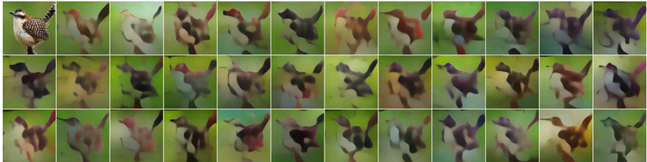
Fig. 3. Top Left: original image with a single salient instance from SOS. Remaining Images: reconstructions of the VAE by slightly increasing the response at individual dimensions in the latent representation. A single value in the latent space can correspond to multiple image characteristics such as lighting, color, numerosity and object size.

observed in cognitive studies [28, 12]. Our methodology is similar to Stoianov and Zorzi [38]: we search for a relationship between the VAE’s latent representations and both cumulative object area and instance count in synthesized images.