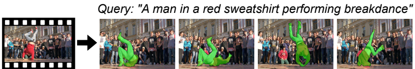
Figure 1: Example result of the proposed approach.

Abstract Most semi-supervised video object segmentation methods rely on a pixel-accurate mask of a target object provided for the first video frame. However, obtaining a detailed mask is expensive and time-consuming. In this work we explore a more practical and natural way of identifying a target object by employing language referring expressions. Leveraging recent advances of language grounding models designed for images, we propose an approach to extend them to video data, ensuring temporally coherent predictions. To evaluate our approach we augment the popular video object segmentation benchmarks, DAVIS 16 and DAVIS 17 , with language descriptions of target objects. We show that our approach performs on par with the methods which have access to the object mask on DAVIS 16 and is competitive to methods using scribbles on challenging DAVIS 17 .