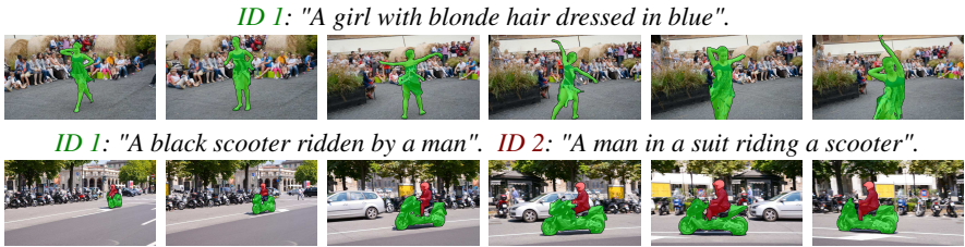
Figure 3: Qualitative results using only referring expressions as supervision.

ting a matching score s_i . Then each box proposal is re-ranked based on its overlap with the proposals in other frames, the original objectness score and its matching score from the grounding model. Specifically, for each proposal we compute a new score: \hat{s}_i = s_i * (\sum_{j=1, j \neq i}^M r_{ij} * d_j * s_j / t_{ij}) , where r_{ij} measures an IoU ratio between box proposals i and j , t_{ij} denotes the temporal distance between two proposals ( t_{ij} = |f_i - f_j| ) and d_j is the original objectness score. Then, in each frame we select the proposal with the highest new score. The new scoring rewards temporally coherent predictions which likely belong to the target object and form a spatio-temporal tube.