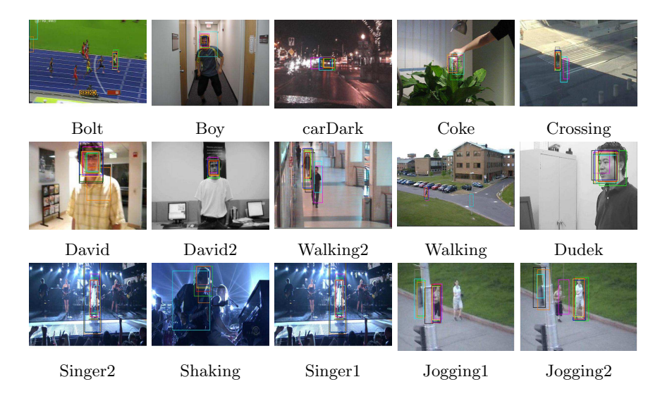
Fig. 4: Visualizations of all tracking algorithms on challenging sequences. Ground Truth: red, GDT(ours): yellow, FCNT: gray, HDT: dark green, HCFT: blue, SO-DLT: green, KCF: black, Struck: orange, TLD: magenta, CXT: cyan.