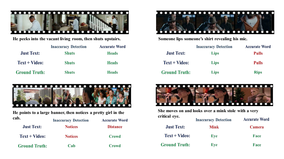
Fig. 4. Here we show four samples of our test results. For each sample, we show a video and an inaccurate sentence, the detected inaccurate word, and the predicted accurate word for substitution. The green color indicates a correct result while the red color shows a wrong result.

show two columns for the detection and correct word prediction. The green and red colors respectively indicate true and false outputs. Note that, for the VTC task, just a good detection or prediction is not enough. Both of these sub-tasks are needed to solve the VTC problem. For example, the left bottom example in Figure 4 shows a failure case for both "Just Text", and "Text + Video", although the predicted word is correct using "Text + Video".