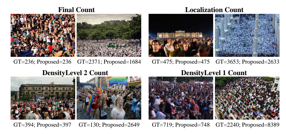
Fig. 4: This figure shows pairs of images where the left image in the pair has the lowest counting error while the right image has the highest counting error with respect to the four components of the Composition Loss.