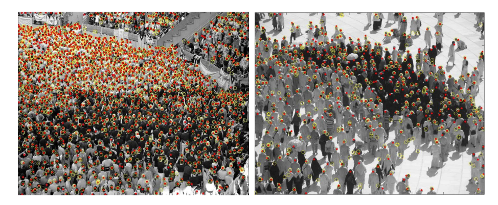
Fig. 5: Two examples of localization using the proposed approach. Ground truth is depicted in red and predicted locations after threshold are shown in yellow.

shown in Table 6. Next, we describe and provide details for the experiment corresponding to each row in the table.