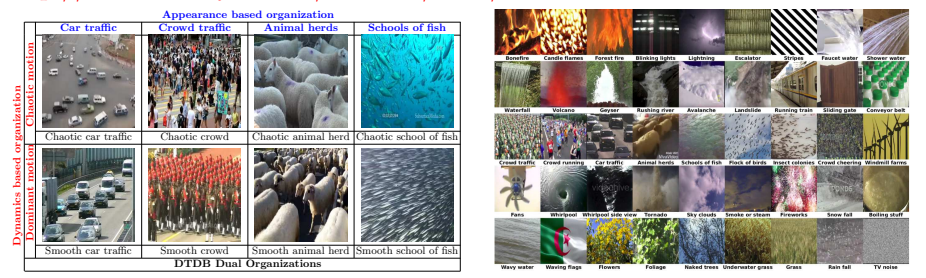
Fig. 1. (Left) Sample frames from the proposed Dynamic Texture DataBase (DTDB) and their assigned categories in both the dynamics and appearance based organizations. (Right) Thumbnail examples of the different appearance based dynamic textures present in the new DTDB dataset. See supplemental material for videos.

lustrates how videos are assigned to different classes depending on the grouping criterion ( i.e. dynamics vs. appearance). 3) We use the new dataset to explore the representational power of different spatiotemporal ConvNet architectures. In particular, we examine the relative abilities of architectures that directly apply 3D filtering to input videos [34, 15] vs. two-stream architectures that explicitly separate appearance and motion information [31, 12]. The two complementary organizations of the same dataset allow for uniquely insightful experiments regarding the capabilities of the algorithms to exploit appearance vs. dynamic information. 4) We propose a novel two-stream architecture that yields superior performance to more standard two-stream approaches on the dynamic texture recognition task. 5) We demonstrate that our new dataset is rich enough to support transfer learning to a different dynamic texture dataset, YUVL [8], and to a different task, dynamic scene recognition [13], where we establish a new state-of-the-art. Our novel Dynamic Texture DataBase (DTDB) is available at http://vision.eecs.yorku.ca/research/dtdb/.