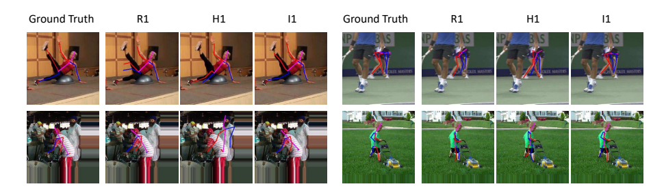
Fig. 3. Example results of regression baseline (R1), detection baseline (H1) and integral regression (I1).

From the above comparison, we can draw two conclusions. First, integral regression using an underlying heat map representation is effective (I*>H, I*>R). It works even without supervision on the heat map. Second, joint training of heat maps and joint coordinate prediction combines the benefits of two paradigms and works best (I>H,R,I*).