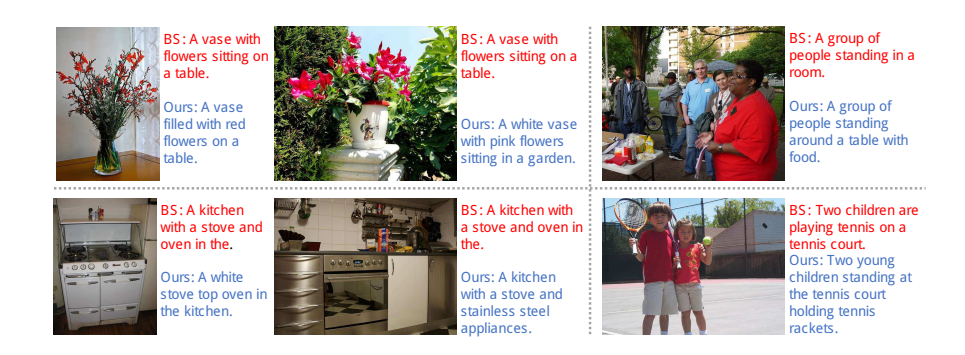
Fig. 4. Qualitative results by baseline model and our proposed model.