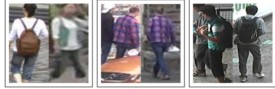
(a) Market-1501 (b) DukeMTMC (c) CUHK03

Datasets For comparative evaluations, we utilised 3 benchmarking person re-id datasets, including Market-1501 [77], DukeMTMC-reID [79], and CUHK03 [25]. Figure 3 shows some examples of person bounding box images from these datasets. In particular, different data collection protocols (including surveillance environments) were employed in constructing these datasets: (a) Market-1501 has 2~6,617 images per person captured by 6 camera views deployed around a university supermarket, with all bounding boxes automatically detected by the Deformable Part Model (DPM) [14]. (b) DukeMTMC-reID contains 2~426 images per person captured by 8 camera views. This dataset was constructed from the multi-camera track-