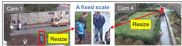
Figure 1. Illustration of scale alignment of person bounding boxes captured at different scales (resolutions) in public space.

Person re-identification (re-id) aims at matching identity classes of person images across non-overlapping camera views deployed over open surveillance spaces. This is an inherently challenging task because person visual appearance may change dramatically in different camera views due to unknown covariates in human pose, view angle, illumination, occlusion, and background clutter [16]. Existing works focus on designing identity discriminative feature representation [17, 13, 75, 29, 39, 37] or learning matching distance metrics [22, 69, 78, 65, 41, 73, 63, 64, 66, 8] or their combination in a deep learning framework [25, 3, 61, 68, 52, 67]. By aligning local body parts for feature extraction followed by cross-view matching, existing methods often resize all the person bounding box images into a single scale as a canonical pre-processing normalisation step [33, 27, 79], that is, existing re-id models assume a normalised single-scale based re-id. This, however, is against that person images are almost always captured in