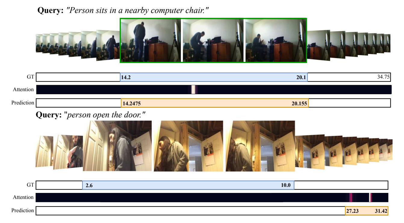
Figure 3: Examples of success and failure cases of our method for Charades-STA.