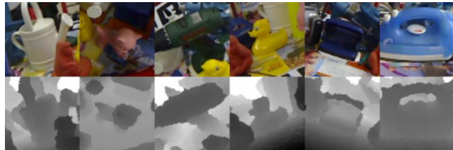
(a) Image examples from the Linemod dataset.