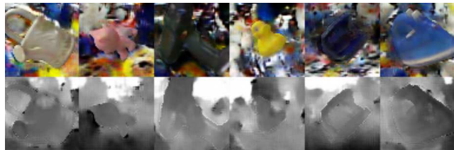
(b) Examples generated by our model, trained on Linemod.

Figure 1. RGBD samples generated with our model vs real RGBD samples from the Linemod dataset [22, 45]. In each subfigure the top row is the RGB part of the image, and the bottom row is the corresponding depth channel. Each column corresponds to a specific object in the dataset. See Sect. 4 for more details.