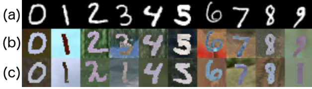
Figure 3. Visualization of our model’s ability to generate samples when trained to adapt MNIST to MNIST-M. (a) Source images \mathbf{x}^s from MNIST; (b) The samples adapted with our model G(\mathbf{x}^s, \mathbf{z}) with random noise \mathbf{z} ; (c) The nearest neighbors in the MNIST-M training set of the generated samples in the middle row. Differences between the middle and bottom rows suggest that the model is not memorizing the target dataset.

mask \mathbf{m} \in \mathbb{R}^k , our masked-PMSE loss is: