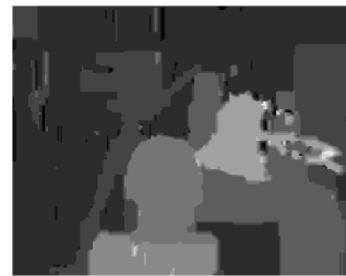
Figure 3. Tsukuba result for quasi-Newton.