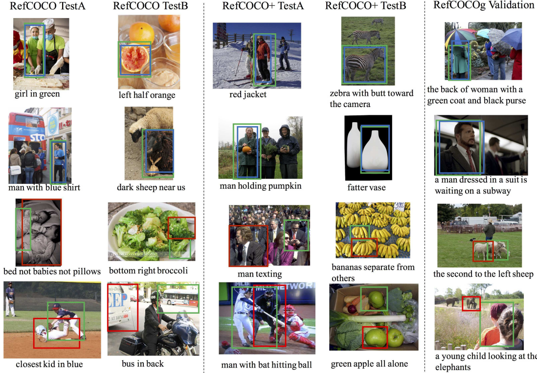
Figure 2: Example comprehension results based on detection. Green box shows the ground-truth region, blue box shows correct comprehension using our “speaker+listener+reinforcer+MMI” model, and red box shows incorrect comprehension. We use top two rows to show some correct comprehensions and bottom two rows to show some incorrect ones.