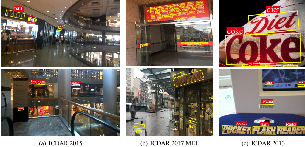
Figure 6: Results of the proposed method. Note: we only show text detection results of ICDAR 2017 MLT due to the absence of text spotting task.