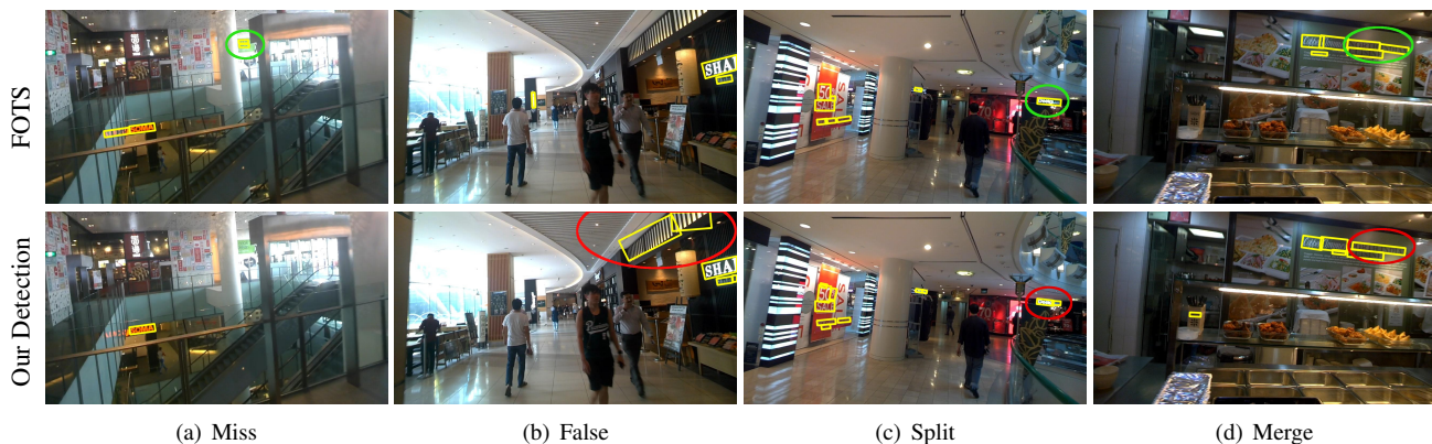
Figure 5: FOTS reduces Miss, False, Split and Merge errors in detection. Bounding boxes in green ellipses represent correct text regions detected by FOTS, and those in red ellipses represent wrong text regions detected by “Our Detection” method. Best view in color.

work, and similarly, detection branch is removed from origin network to get the recognition network. For recognition network, text line regions cropped from source images are used as training data, similar to previous text recognition methods [44, 14, 37].