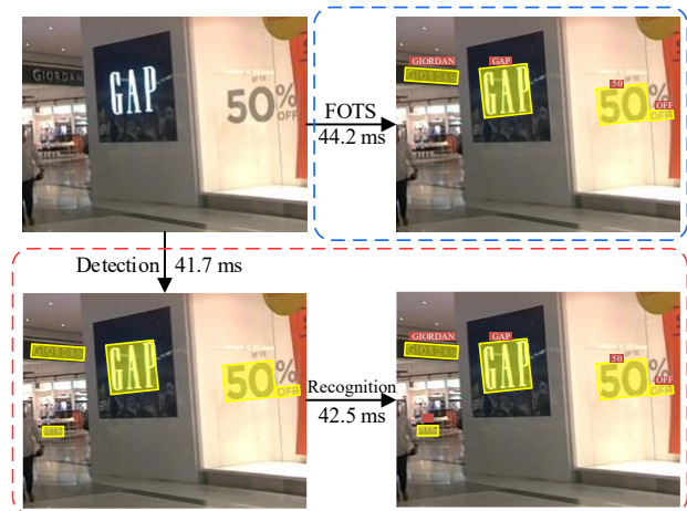
Figure 1: Different to previous two-stage methods, FOTS solves oriented text spotting problem straightforward and efficiently. FOTS can detect and recognize text simultaneously with little computation cost compared to a single text detection network (44.2ms vs. 41.7ms) and almost twice as fast as the two-stage method (44.2ms vs. 84.2ms). This is detailed in Sec. 4.4.

The most common way in scene text reading is to divide it into text detection and text recognition, which are handled as two separate tasks [20, 34]. Deep learning based approaches become dominate in both parts. In text detection, usually a convolutional neural network is used to extract feature maps from a scene image, and then different