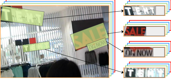
Figure 4: Illustration of RoIRotate. Here we use the input image to illustrate text locations, but it is actually operated on feature maps in the network. Best view in color.

and the shrunk version is considered as “NOT CARE”, and does not contribute to the loss for the classification. Denote the set of selected positive elements by OHEM in the score map as \Omega , the loss function for classification can be formulated as: