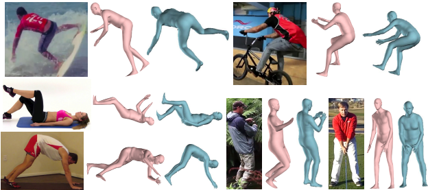
Figure 4. Examples from UP-3D where our approach (blue shapes) performs significantly better than the direct prediction method of Lassner et al. [22] (pink shapes).

performance benefit. This is an interesting empirical result demonstrating that training with reprojection losses can be useful not only for end-to-end refinement, but it can also assist the network with novel information recovered from 2D annotations. Some qualitative results from UP-3D using our best model are presented in Figure 3.