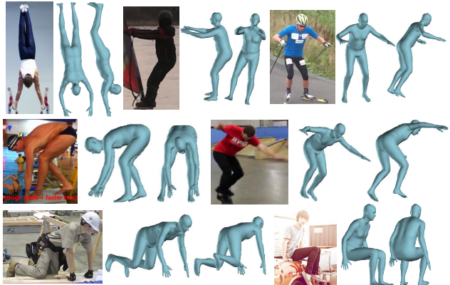
Figure 3. Successful 3D pose and shape predictions of our approach on challenging examples of UP-3D.

either from UP-3D (provided by Lassner et al. [22]), or from CMU MoCap (provided by Varol et al. [51]). The Human2D network remains the same in both cases.